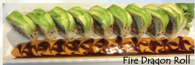
Fire Dragon Roll

Inside : Spicy Fish Mix, BBQ Eel, Green Onion, Carrot, Cilantro, Beet and Sprouts Outside : Avocado, Spicy Tahini and teriyaki Sauce